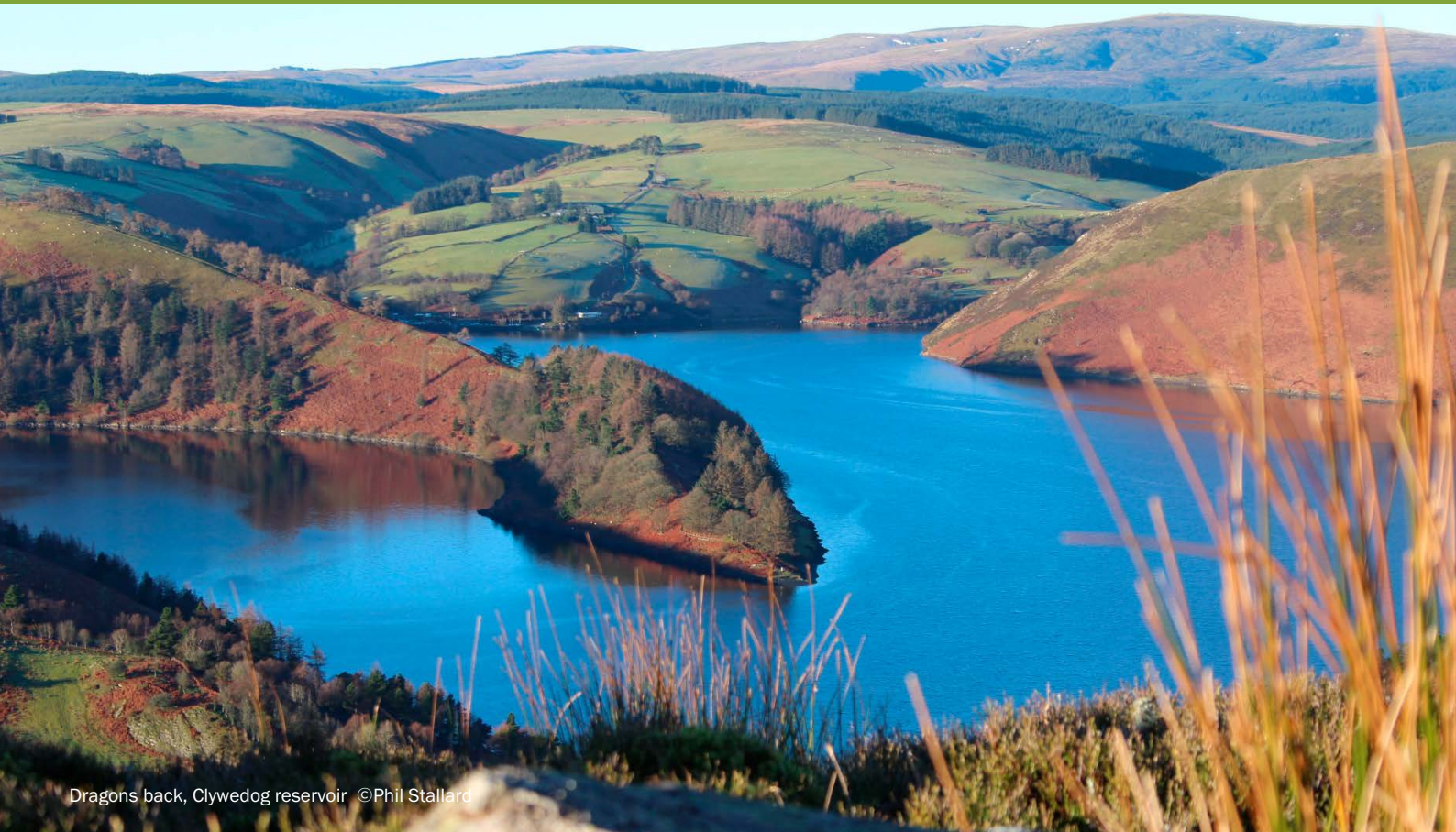
Dragons back, Clywedog reservoir