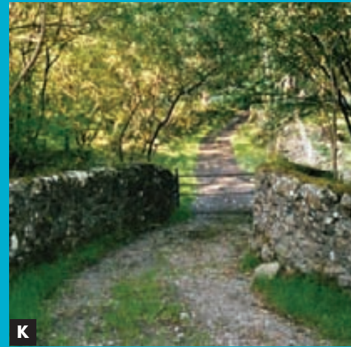
Pont Helygog bridge

Just before the path descends, look down to the left and the hamlet and church of Bryn Coed Ifor may be visible through the trees. You have