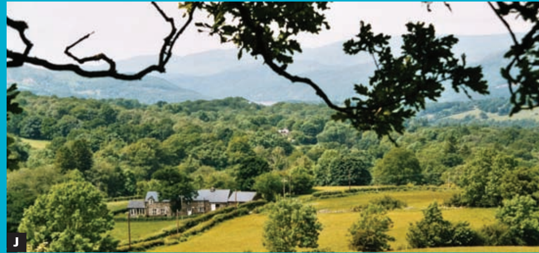
Looking back towards Cwm Hafod Oer