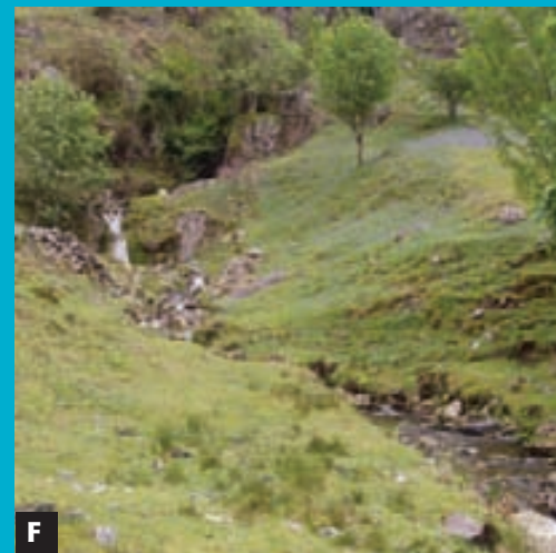
Waterfall on the right at Cwmrhwyddfor

As the valley and path narrow, the climb begins to get harder and you might find it helps to count the telegraph poles, or to look out for the variety of flowers appearing in spring, or the heather and rowan trees in late summer. At the end of the climb, have a rest on the concrete mound and take in the view. If you look back after walking up G Cwmrhwyddfor on the left you will see the Devil's Pulpit – Craig y Llam. On the right is Craig Cwmrhwyddfor – part of the Cadair Idris range. Lake Mwyngul (Taly-Llyn) is below in the valley. The parish church of Taly-Llyn stands on the far shore of the lake where,