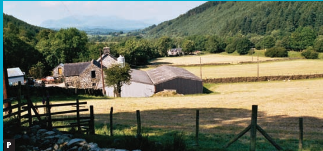
Looking back towards Cadair Idris

Ignore the Tir Gofal path to your right, continuing instead downhill to the left on a grassy path. Cross over a small stream (although this may not be there in dry weather!). Pass through the gate (SNP sign) and follow the path down to the right. At the signposted ladder stile, climb over and follow the wooden handrail to your left until you come to the grassy forestry path OS 836246 . If the path is overgrown it may be easier to enter this forestry path via the rickety wooden gate before the way marker sign. Follow the grassy path under the overhanging trees. The path opens out after crossing a small stream and