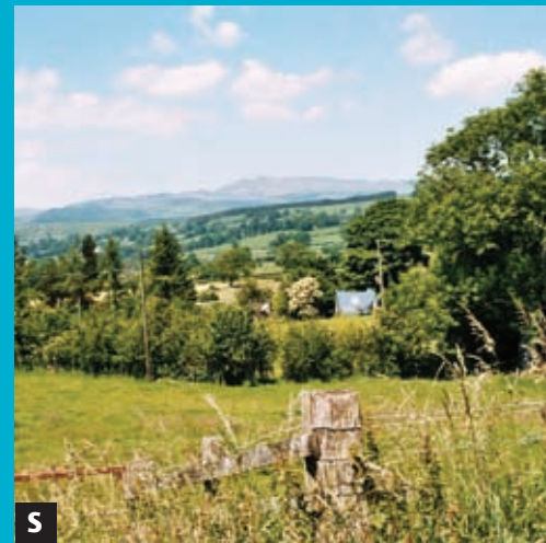
S Leaving Llanuwchllyn heading for Llangywer

If you want to follow the path instead, follow the path up to 22 Ffynnon Gywer farmhouse OS 899316 . Proceed through a small gate on the left, continuing on the path through the field. There is a well-trodden green path straight ahead, which has beautiful views of Llyn Tegid and Bala with the backdrop of Moel Emoel, Foel Dryll and Foel Goch. Enter the wooden gate, crossing the