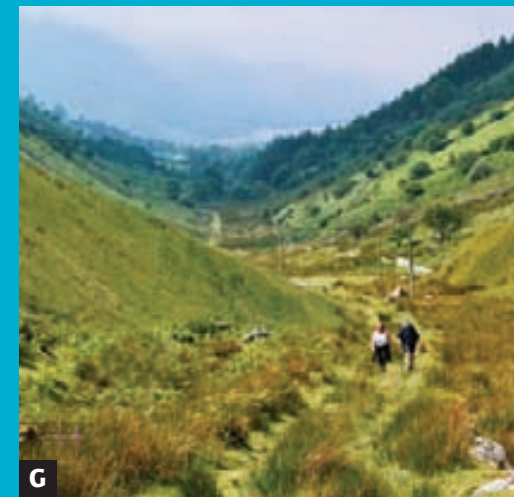
Walking up Cwmrhwyddfor

Follow the path on the right of the road through the bracken. Leaving the bracken, keep close to the fence on your left. When you reach the ladder stile, ignore the path sign. Climb down to the A487, taking extreme care. This is a new path which avoids using the A487. Cross the road with care to a small stile, follow the shale path to next stile, then follow the notes in the next paragraph. Turn right and follow the A487 for 0.1 miles over the brow of the hill. Follow the curve of the double white lines until you come to a ladder stile on your left. You have now left the Taly-Llyn valley and are entering H Cwm Hafod Oer. In