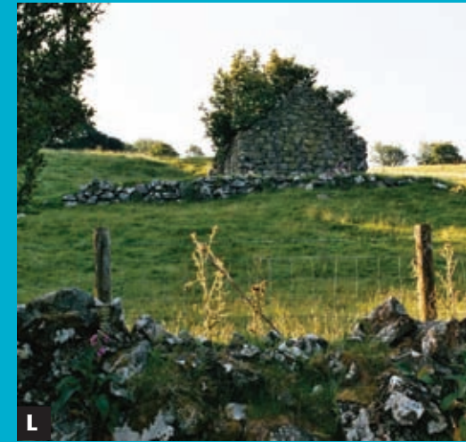
Ruined building on right before entering wood

Proceed down the tree-lined path through the 'crossroads'. You will see a stone building in the field to your right. A dry stone wall should be to your right, with hazel trees to the left as you head for the bridge 12 Pont Rhydygwair. Once over the bridge, ignore the gated path to your left. Continue uphill through the bluebells or bracken, then through a metal gate. Ignore the metal gates to the left and right. This area is used as sheep pens. Head for the metal gate directly in front, ignoring the metal gate to your right and the track to the left. Keep to the path, passing a cowshed on the left and the farmhouse further down to your left. Ignore the gate to the farm track to your left. Continue on the path and you will come to a walled open section ahead. Note the sheep opening in the left wall in line with the farmhouse. Continue through the wooden gate. At the crossroads continue straight ahead but take the time to look back and enjoy the magnificent views of the Mawddach estuary and Cadair Idris. Enter the second wooden gate. Ignore the opening to the left and the rough grass track to Llwyn-y-Ffynnon