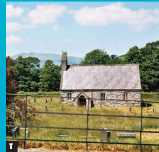
T St Gywer Church

unclassified road and following the public path through the gate for Cae Glas. The path passes in front of the farmhouse. Keep the fence to your right. Follow the signposted path to the left, keeping the hedge on your left. Ignore the entrance to the left, instead following the path down to the ladder stile and over the stream. Go uphill to the field, following the marked path straight ahead. When you reach the middle of the field, down to your left you will see the hamlet of Llangywer and T St Gywer Church (now closed). Cross over the ladder stile and follow the path down through the field. Turn right, keeping Tŷ Cerrig farmhouse to your left. Proceed through the metal gate and the second metal gate/ladder stile to your right. Climb over the ladder stile/gate. Follow the path ahead, which may be muddy in places, with a ditch to the left. Leave the field over the ladder stile/metal gate. Continue straight ahead, down through the avenue of trees. Cross over the ladder stile and out into the clearing. Ignore the forestry road to the right, turning left instead over the concrete bridge. Follow the markers. Turn left on to an unclassified road and walk down the valley of Glyn Gywer. A glorious view of the Arennig mountains will appear before you.