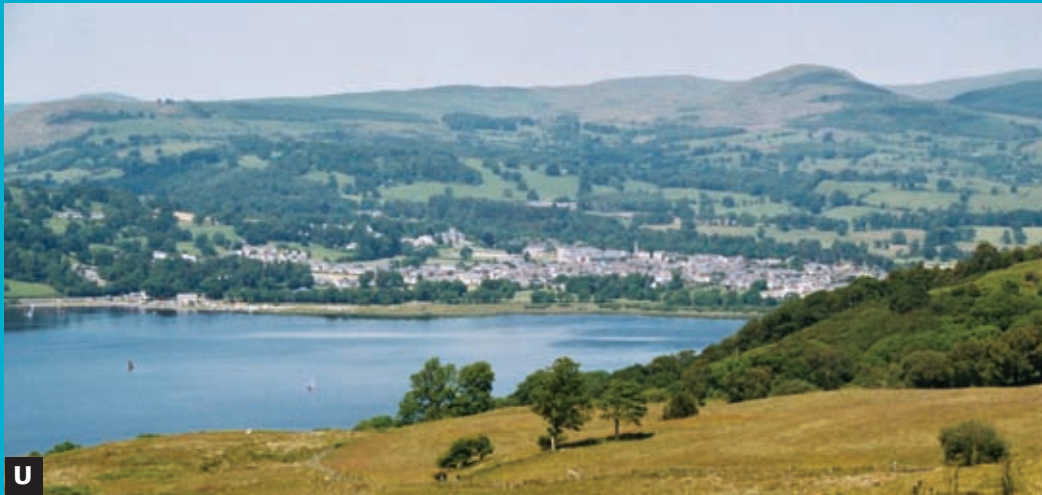
U Splendid view of Bala

stream and follow the obvious path on your right which then veers left up through the bracken and continues uphill. Cross over the stream and straight on along the upward path. U From here there are splendid views of Bala, with the spires of Capel Tegid, built in memory of Thomas Charles, Christ Church and the castle-like Presbyterian Youth Centre, Coleg y Bala. OS 921332 Cross over the ladder stile, leaving the 'open access' land, turn left and follow the fence to your left downhill and over the next ladder stile. Aim for the path marker.