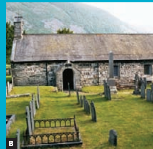
B Llanfihangel-y-Pennant Church

OS 672089 As you exit the church, take the public footpath opposite, signposted beside the postbox. There are public toilets here. Pass Llwyn Celyn on your right. Climb over the ladder stile and go past the ruin of an old chapel. Take the path uphill, more or less following the Nant yr Eira stream. Opposite the waterfall, turn and