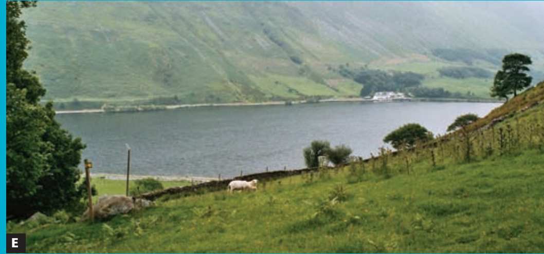
Ladder stile at field corner