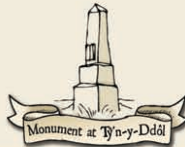
Monument at Tŷn-y-Ddôl