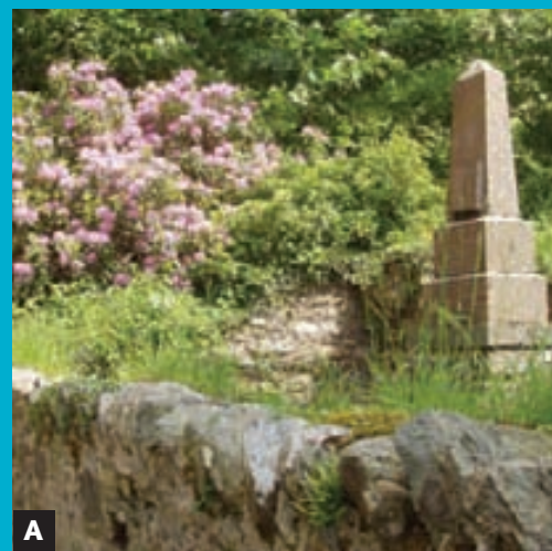
A Tŷ'n-y-Ddôl: Mary Jones' home